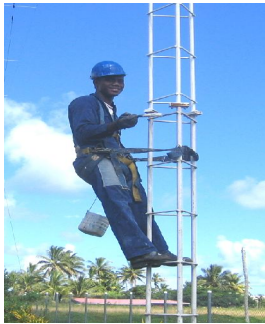
ELCOM Officials installing & maintenance of HF Radios