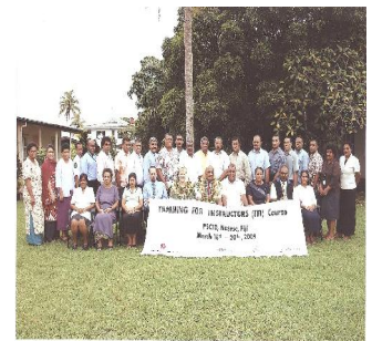
TFI Participants Group Photo

MGM High School conducted a full scale Evacuation Drill on 24/4/09. The stakeholders/Integrated partners participation made the program a success [Fiji red Cross; St John Ambulance; Mineral resource Department; National Fire Authority; Ministry of Information; Media and NDMO]